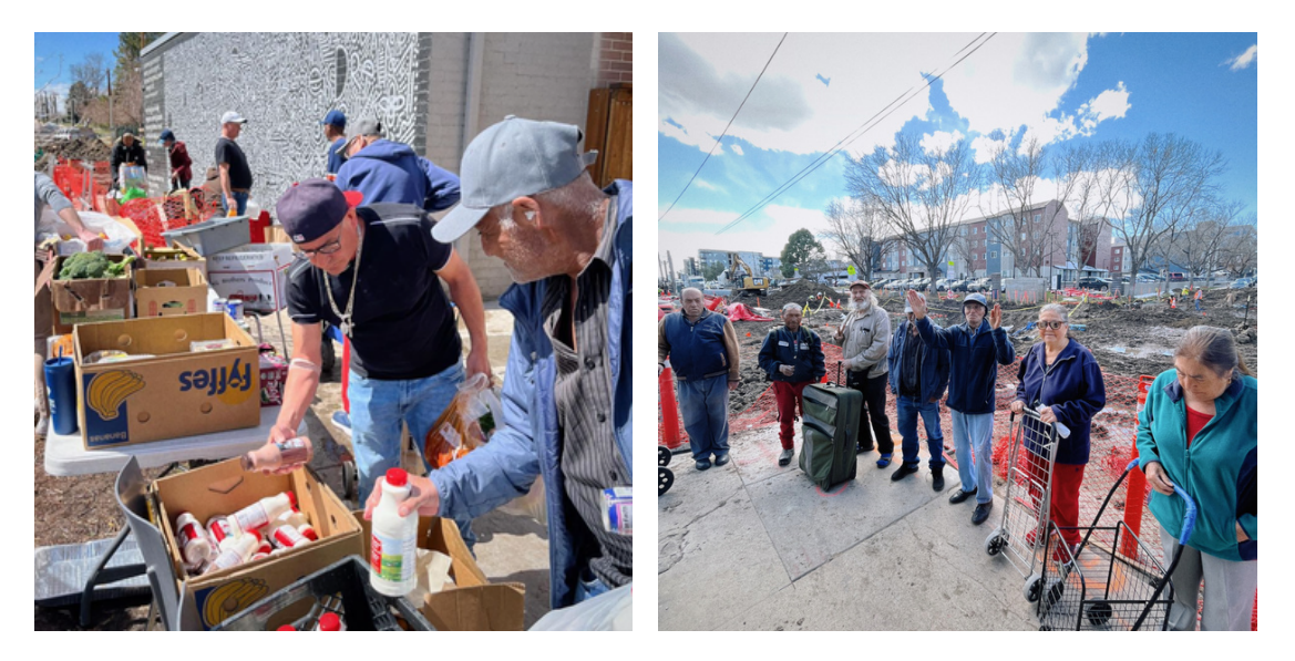
Participants of the NCGP navigating the line amidst ongoing construction on Decatur street.

Despite these obstacles, our outreach has expanded, attracting new neighbors who have learned about our services. In 2023, we celebrated the strength, unity, and resilience of our community as we faced these challenges together.