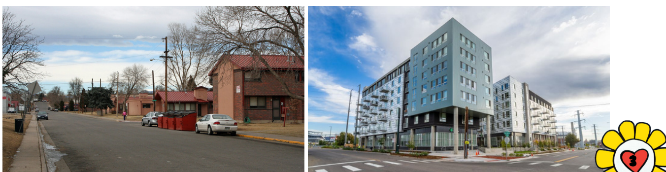
Before DHA Redevelopment (2016)

In 2016, the Denver Housing Authority (DHA) was awarded a $30 million Choice Neighborhood Initiative (CNI) Implementation Grant from HUD. This grant supports DHA in implementing the Sun Valley Neighborhood Transformation Plan. The plan involves replacing 333 public housing units with over 960 mixed-income housing units across four phases. Initially, this led to the removal of DHA townhomes and the displacement of families. However, as of 2023, many familiar faces have returned to the neighborhood, moving into new DHA housing developments like Greenhaus, Gateway, and Thrive. Over the next five years, construction will continue in the neighborhood as the redevelopment process advances through its phases.